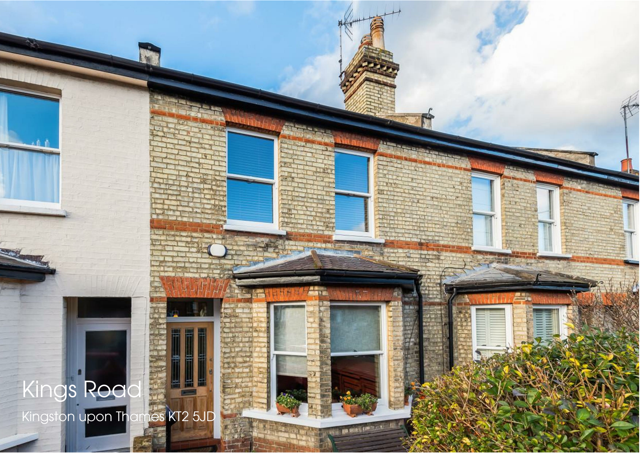
Kings Road Kingston upon Thames KT2 5JD